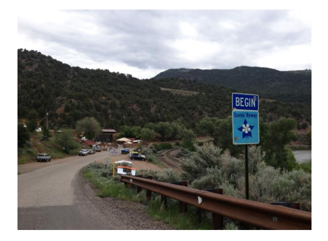
Begin Byway sign in State Bridge

Pre-notification Signage for byway in State Bridge