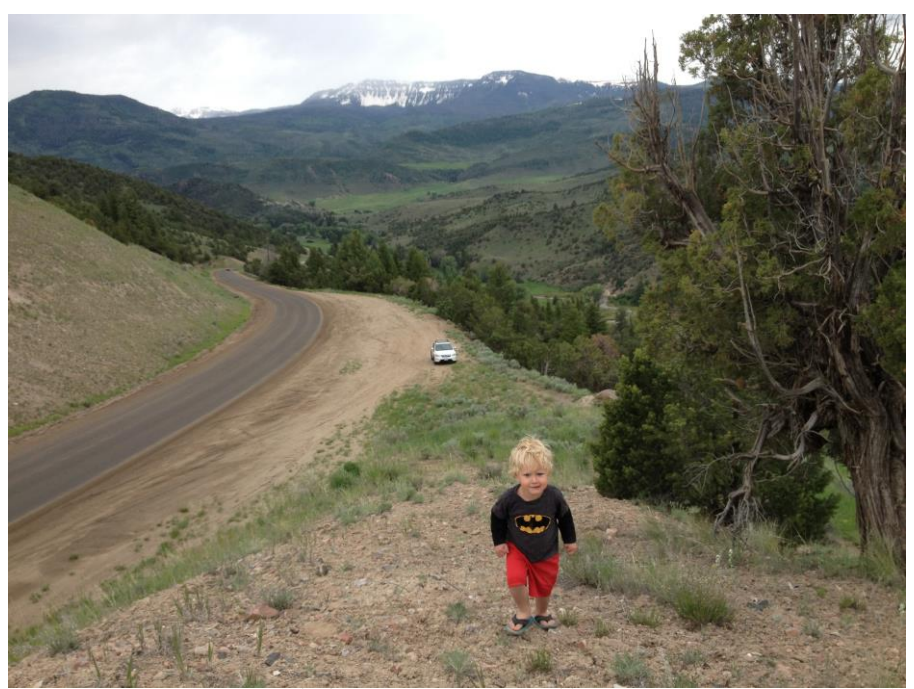
Pull-Off near Radium with a manageable hill climb