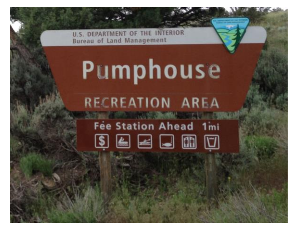
BLM Attraction Signage