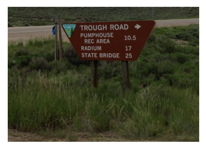
BLM Directional Signage with mileage