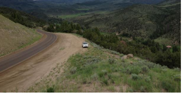
Pull-Off with no signage