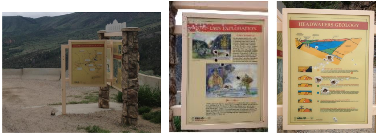
Interpretive Signage at Inspiration Point